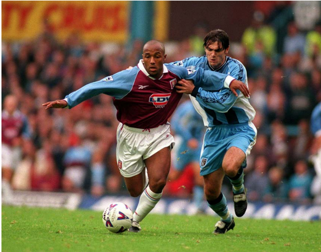
Fig. 2. Is football a “physical” activity? Certainly not. It is an activity of the whole person. The exquisite co-ordination of over 600 muscles, some to contract explosively, others more subtly or not at all, depends upon the constant projection of impulses from the central nervous system. These impulses are refined, directed and controlled by intentions, thoughts and feelings.

The idea that the individual always acts as a whole is known in the Alexander Technique as the principle of unity . And rather than talking about the mind and the body as if they were two unrelated realities, we prefer to use the single term, the psycho-physical self . The quotation marks we place around the words ‘mental’ and ‘physical’ are to indicate a certain dissatisfaction with these terms. Given that the human being acts as a whole, we prefer to avoid adjectives which imply that there are two different types of activity. We use them only because it is very difficult to introduce new ideas without using the words with which we are familiar.