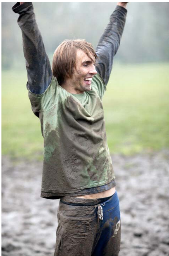
Fig. 3. Emotion cannot be understood as an internal “mental” state. It is a complete pattern of the whole person. This accounts for the visible and communicative nature of emotion. We can see this man’s jubilation and be moved by it.

Our tendency to divide the human being in two, to see the mind as something separate and different to the body, has a very long history. As far back as the fourth century St. Augustine of Hippo wrote about a struggle between the soul and the body. Whether or not St. Augustine’s concept of the soul is equivalent to our modern concept of the mind, he was nonetheless describing a human being divided down the middle into parts which were not only independent, but actually in conflict with each other. The early Christians didn’t invent this dualism, but probably inherited it from Greek philosophy, 5 and we can only guess where the Greeks got it from. Its origins may go way back to our pre-literate history. It has even been suggested that our tendency to perceive a separate ‘mental’ entity within us is a side effect of the evolution of the cerebral cortex and the development of consciousness, and may be very ancient indeed. 6